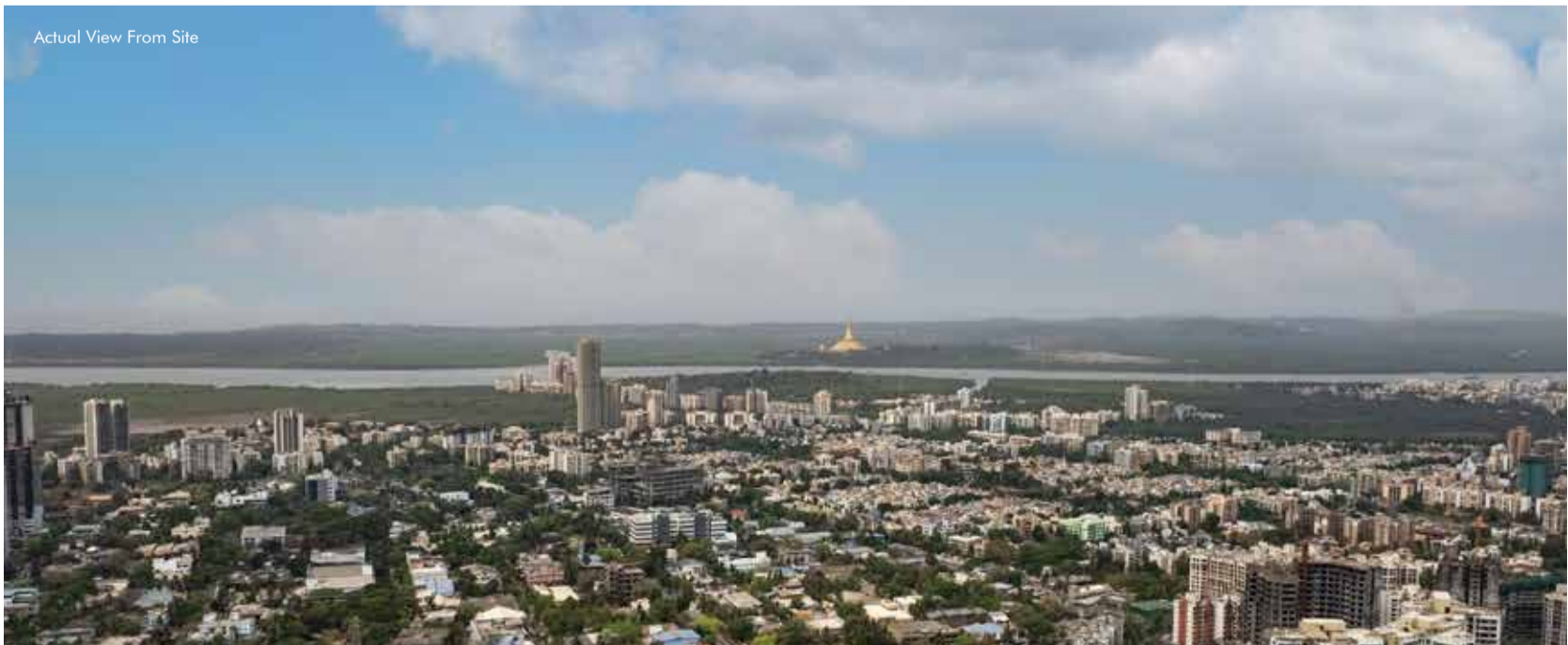
Actual View From Site

Party Deck | Swimming Pool Banquet Hall | Games Room Library | Mini Theatre Gym | Jain Temple Landscaped Rooftop Terrace Double-height Lobby